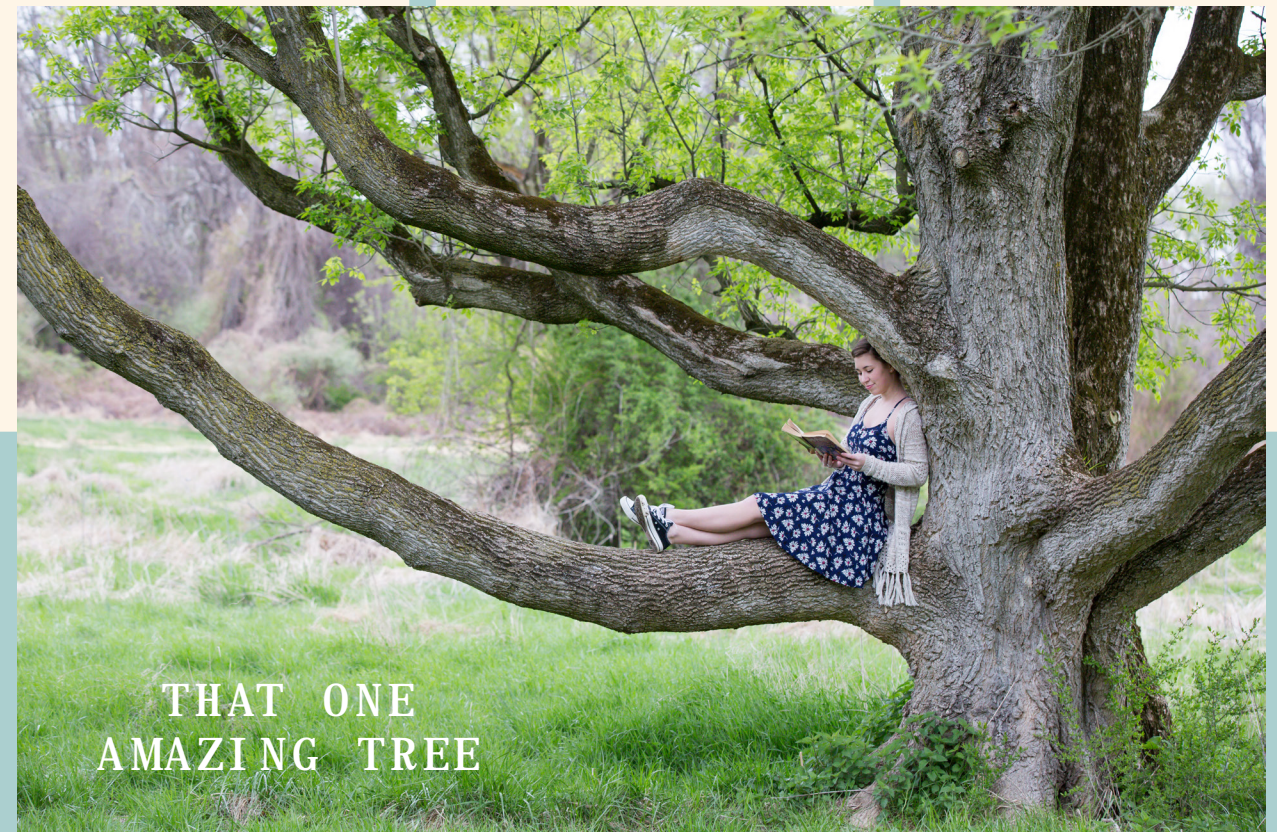
THAT ONE AMAZING TREE