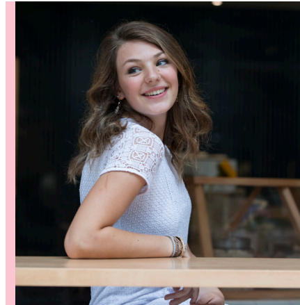
COFFEE SHOP VIBES